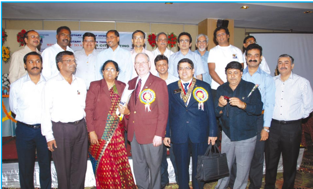
RCSS members with International President Elect