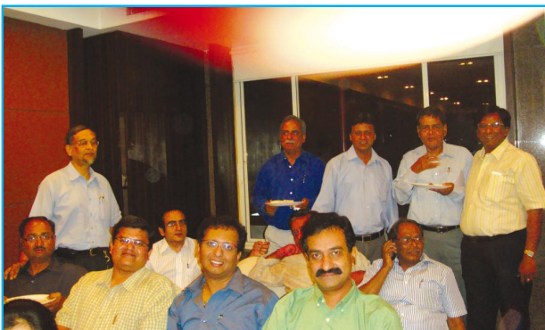
Members at Joint Speaker Meet