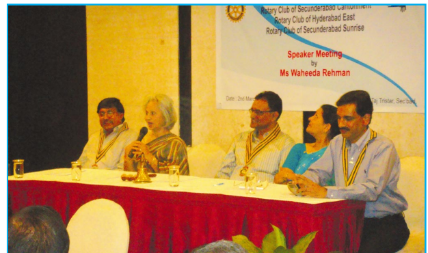
Joint Speaker Meet