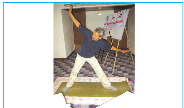
Demonstration of Yoga