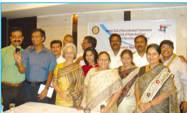
Joint Speaker Meet