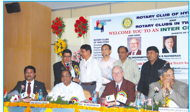
RCS Sunrise and RCS Spectrum members with International President Elect